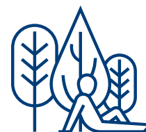
PLACES FOR LEISURE