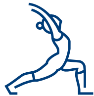
INDOOR & OUTDOOR FITNESS

Fitness Classes Classes Game Nights Club Gatherings Holiday Celebrations Teen Nights Book Club