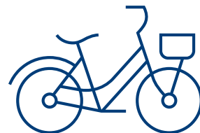
WALKING & BICYCLE PATHS

Entertainment Outdoor Fitness Yard Games Food Truck Rallies Farmer's Market